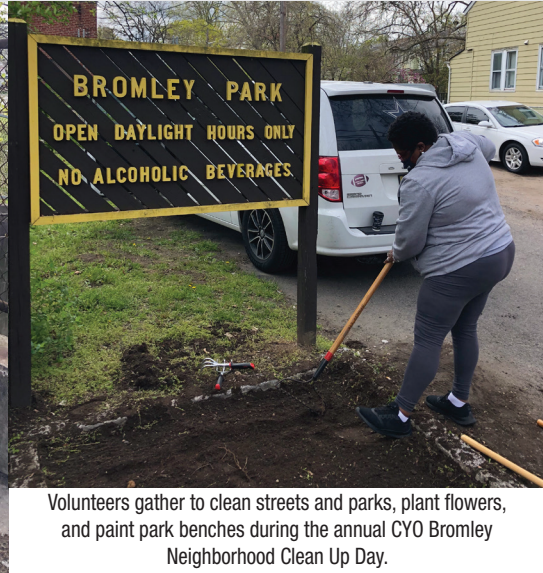
Volunteers gather to clean streets and parks, plant flowers, and paint park benches during the annual CYO Bromley Neighborhood Clean Up Day.