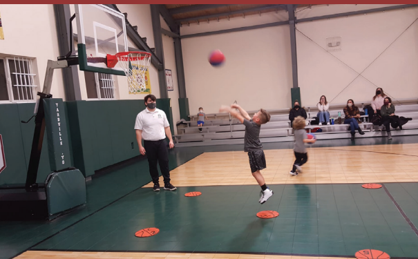
Basketball clinic shooting drills at the CYO Yardville Center.