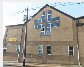
East State Street Center 794 East State St., Trenton (609) 989-8143