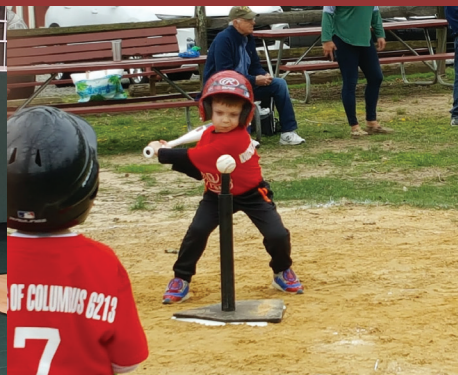
Batter Up! T-Ball league opening day lead off hitter!