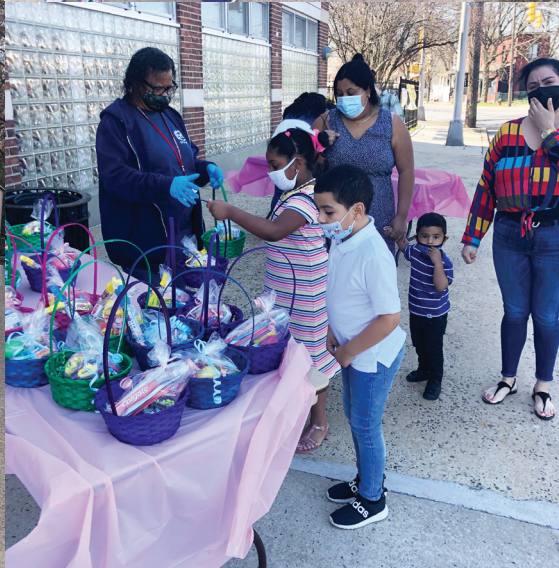
Children line up to get their Easter Basket and a pizza lunch at the annual CYO Easter Basket Pick Up.