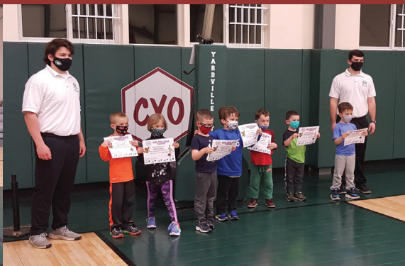
T-Ball clinic participants and instructors pose for a picture with their certificates of completion.