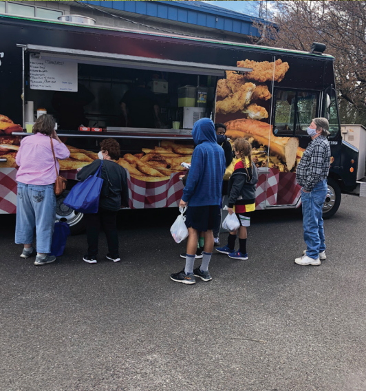
Food Pantry members line up for a free lunch at the CYO Spring Food Festival, which also included an extra food box and a $25 food store gift card.