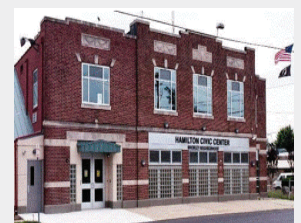
CYO Bromley Center 1801 East State St., Hamilton (609) 587-8100