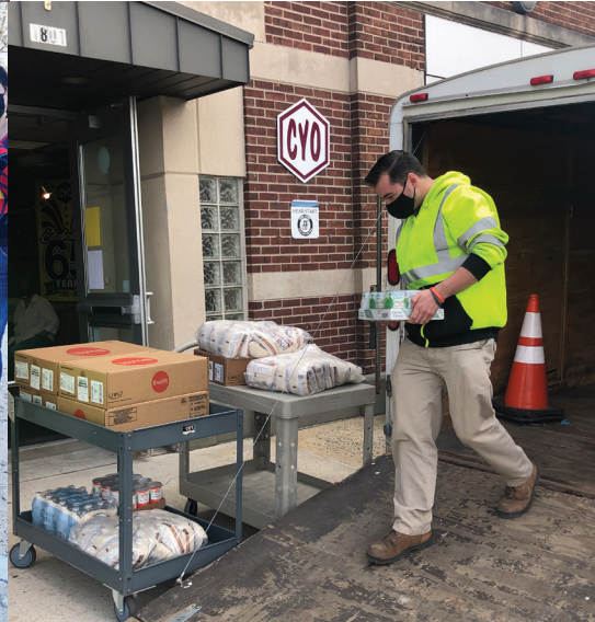
Hamilton Township Public Works employee unloads food coming from the State Food Bank in Vineland, NJ to the CYO Bromley Center