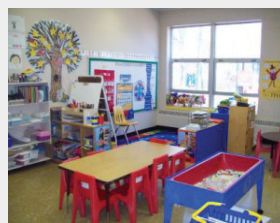
Ewing CYO 320 Hollowbrook Dr., Ewing (609) 883-1560