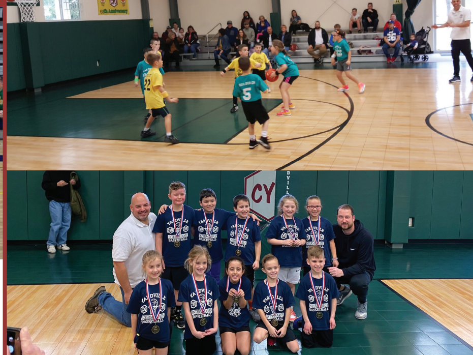
Yardville Pee Wee and Intermediate Basketball Action and Medal Cemerony Photos!