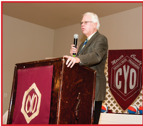
Bob Ryan, Trenton native and former award winning columnist of The Boston Globe and current ESPN personality speaks at the Hall of Fame Award Dinner about his CYO Basketball playing days and growing up in Trenton.