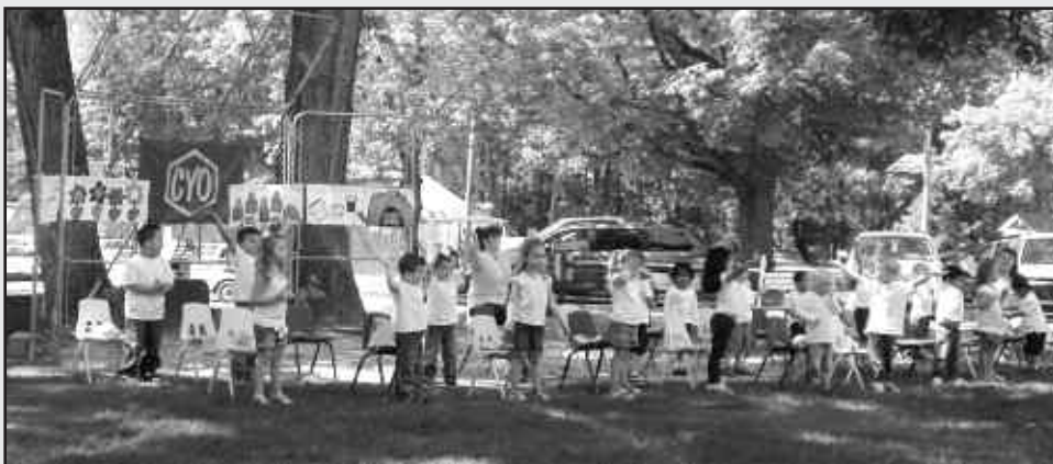
Yardville CYO Preschool 3 and 4 year old students perform at their annual spring concert.