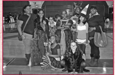
Students from the Trenton After School Program take a minute to gather for photos before the Halloween parade in the CYO Center gymnasium.