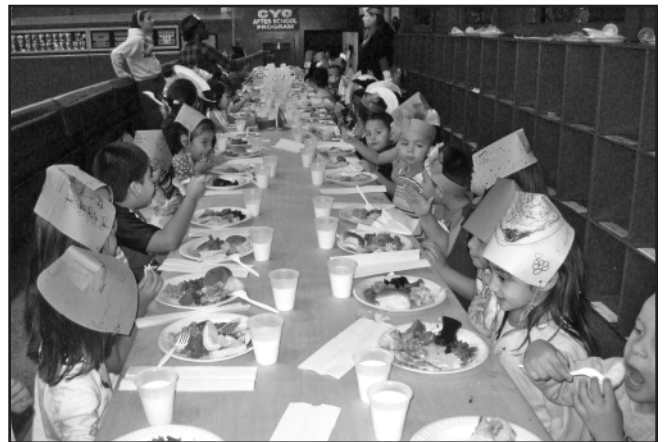
Trenton Preschool children enjoying Thanksgiving Feast.