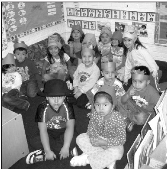
Children listening to a Thanksgiving story.

Our school which has 90 students from ages 2 1/2 to 5 years old is currently in its 12th year. Children enjoy a variety of trips and activities. Recently, classrooms visited the Trenton War Memorial to see the play "Harold and the Purple Crayon", and in the October, picked pumpkins at Johnson's Family Farm in Medford.