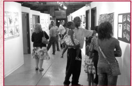
Parents of campers from Trenton and Ewing CYO Summer Camps stroll through the gallery at Art Works checking out the work that their children did this past Summer. The kids' artwork was displayed in the Art Works Community Gallery for the entire month of August.