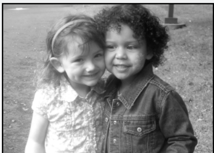
Friends enjoying the Fall Festival.

Plans for next year's Fall Festival are already in progress. It is tentatively scheduled for Sunday, September 30, 2007. For more information contact Kara DeBonis at 609-585-4280.