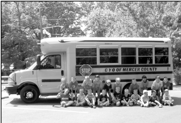
CYO Campers pose in front of the new Mini-Bus purchased by the CYO through the Grant from Kraft Foods.

The Kraft Employee Fund Northeast is a workplace-giving program supported by contributions from Kraft employees across the Northeast area. Kraft Foods, in showing its support, makes annual financial contributions to the Fund, and absorbs 100% of its administrative costs. The KEF 2006 grant program awarded more than $776,000 to twenty-four community benefit organizations, including CYO, in the focus areas of Elder Services, Healthy Lifestyles, Hunger & Youth Development.