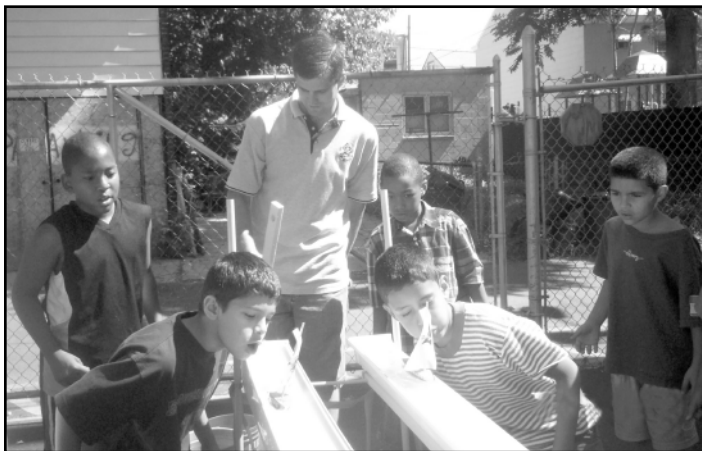
Campers of Cub Scout Pack 920 from the CYO Summer REC Camp participate in The "Rain Gutter Regatta".