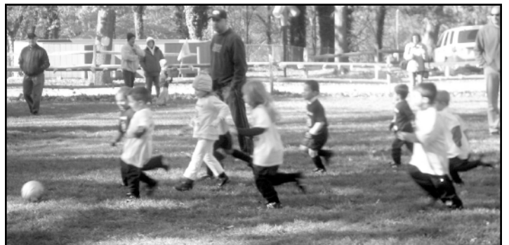
Players chase the ball during action for the New CYO Yardville Soccer League.

We would like to thank our Soccer League sponsors; The Flooring Craftsmen; Nini Plumbing; Security Dynamics; and EMR Contracting.