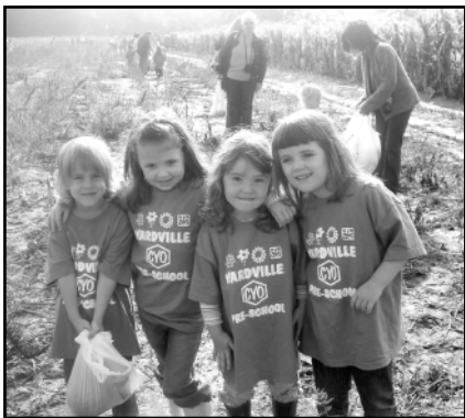
Yardville Pre-School students take a minute to pose for a picture during a recent field trip to Windsor Farms for Pumpkin picking and a hayride.

This is going to be another great school year!